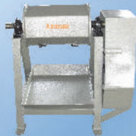
Wire Cleaning Machine