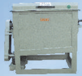
Wire washing machine