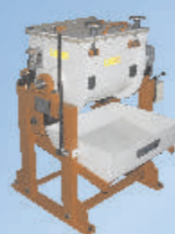
Dry Mixer 20Kgs.