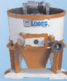
Wet Mixer 10Kgs