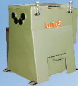
Wet Flux Reclamation Machine